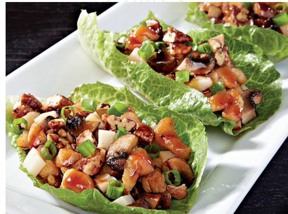
Thai Chicken Lettuce Wraps

All prices are per person. Buffets do not include area rental, tax or gratuity. Revenue minimums may apply. Minimum of 15 guests required. NOTICE: CONSUMING RAW OR UNDERCOOKED MEATS, POULTRY, FISH/SHELLFISH OR EGGS MAY INCREASE YOUR RISK OF FOODBORNE ILLNESS, ESPECIALLY IF YOU HAVE CERTAIN MEDICAL CONDITIONS. BEFORE BOOKING YOUR PARTY, PLEASE INFORM YOUR SPECIAL EVENTS REPRESENTATIVE OF ANY FOOD ALLERGIES.