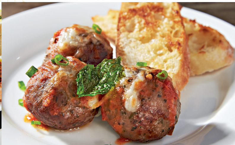
Three Cheese Italian Meatballs

All prices are per person. Buffets do not include area rental, tax or gratuity. Revenue minimums may apply. Minimum of 20 guests required. NOTICE: CONSUMING RAW OR UNDERCOOKED MEATS, POULTRY, FISH/SHELLFISH OR EGGS MAY INCREASE YOUR RISK OF FOODBORNE ILLNESS, ESPECIALLY IF YOU HAVE CERTAIN MEDICAL CONDITIONS. BEFORE BOOKING YOUR PARTY, PLEASE INFORM YOUR SPECIAL EVENTS REPRESENTATIVE OF ANY FOOD ALLERGIES.