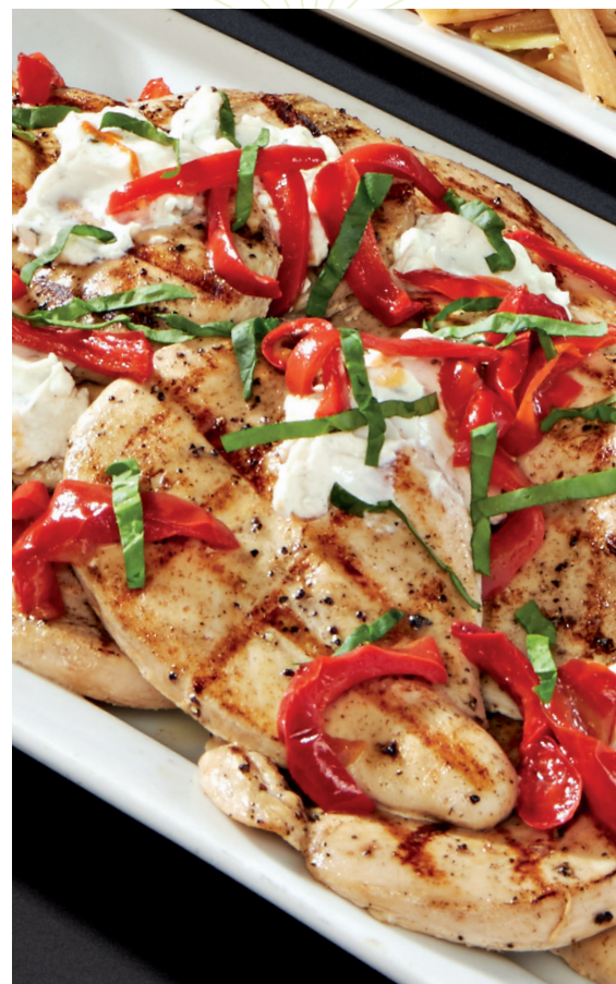
Monte Carlo Chicken

INCLUDES A $30 POWER CARD® WITH UNLIMITED VIDEO GAME PLAY!