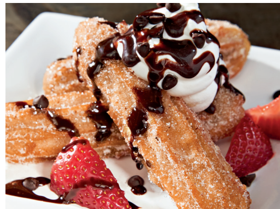
Churro Party Station